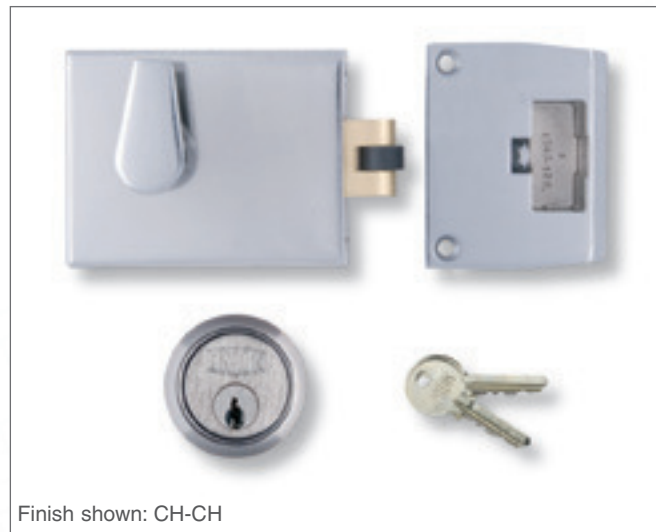
Finish shown: CH-CH