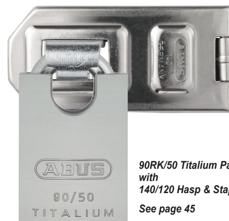
90RK/50 Titalium Padlock with 140/120 Hasp & Staple See page 45