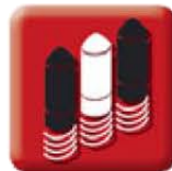
With Hardened Pins