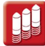
6 Locking Elements