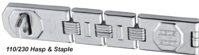
110/230 Hasp & Staple