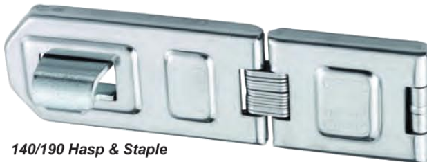
140/190 Hasp & Staple