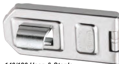
140/120 Hasp & Staple

Made in Germany Saw Resistant Marine Grade Hasp