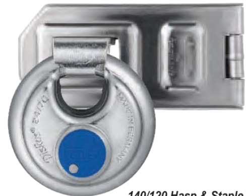
140/120 Hasp & Staple with 24IB/70 Diskus Padlock

ABUS carded hasps & staples are supplied with screws Boxed Hasps & Staples are supplied without screws DG - Double jointed - refers to hasps with a hinge for flexible use