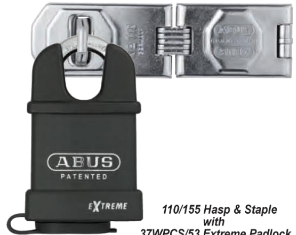
110/155 Hasp & Staple with 37WPCS/53 Extreme Padlock