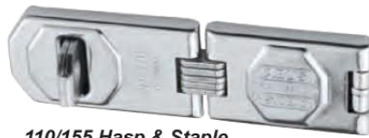
110/155 Hasp & Staple