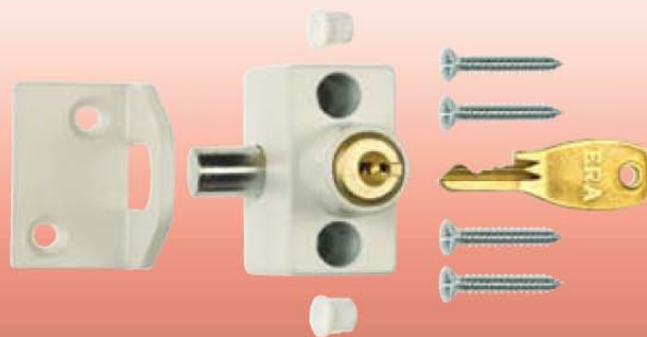
SASHBOLT - CUT KEY VERSION