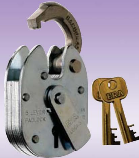
CLOSE SHACKLE PADLOCK